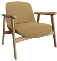
4L WOOD WITH ARMS