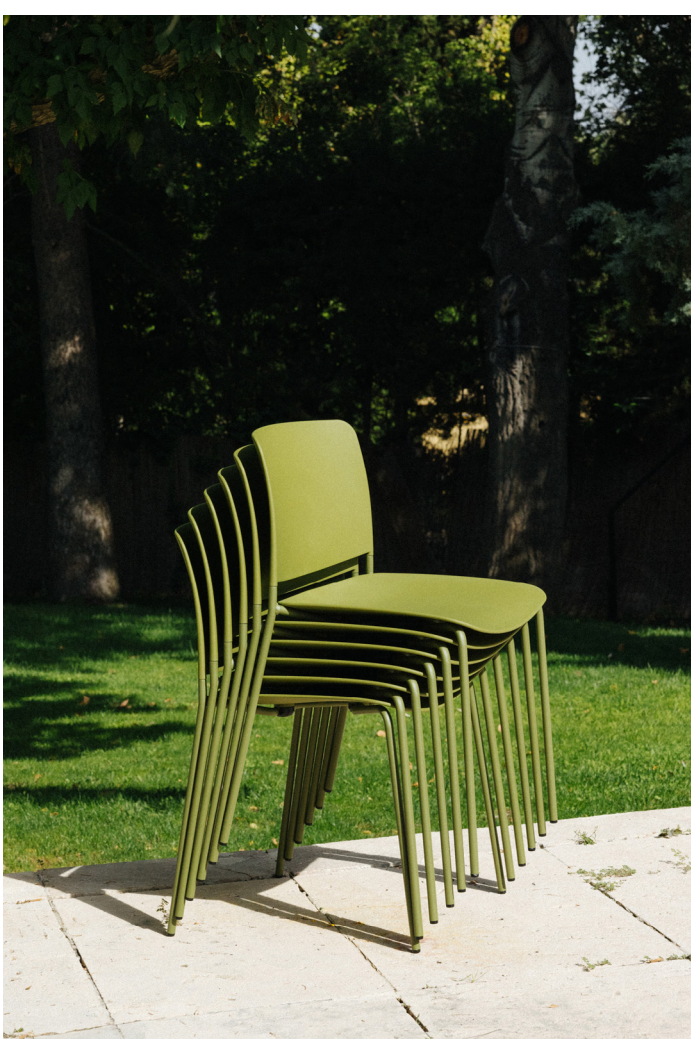
It is a stackable, lightweight and versatile chair that can be part of a home kitchen or dining room, but can also fit perfectly into any space in the contract and restaurant sectors.