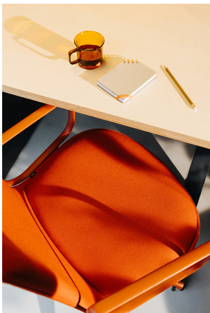
Their sleek and minimalist design is based on adaptable cutting-edge technology for optimal comfort and performance.