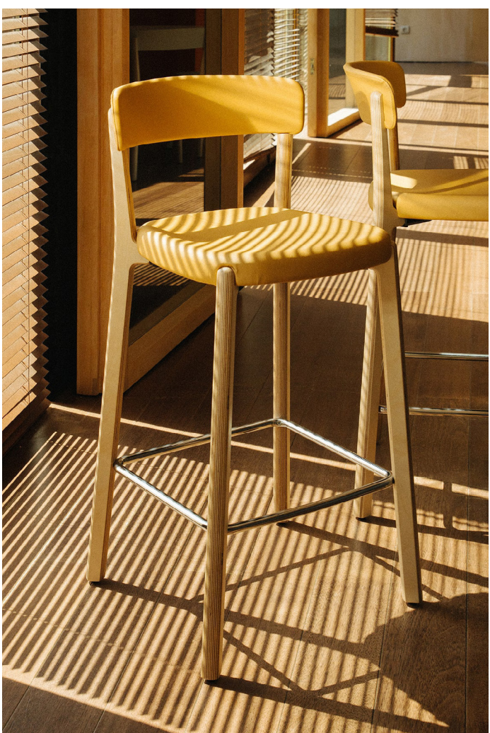
With a beech veneer laminated wood structure with direct bonding to polypropylene to improve its flexibility, and the seat and backrest can have different finishes, this stool is your best ally.