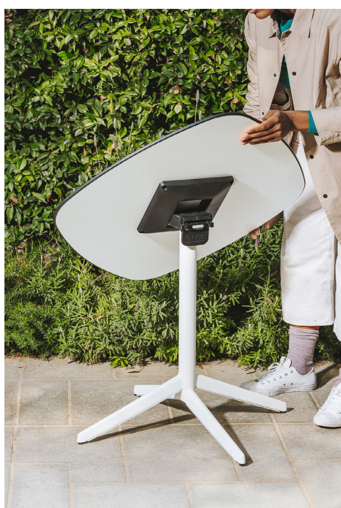
In addition to its amazing looks, the Pile base, with its distinctive design, offers full stability with an exclusive folding mechanism that helps you to effortlessly fold the tables for easy storage.