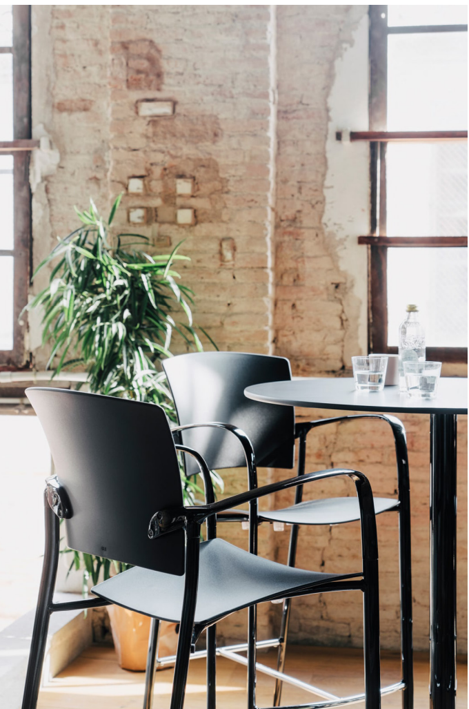
It is the perfect choice for a wide range of spaces, including classrooms, conference and concert halls, and spaces in the contract sector.