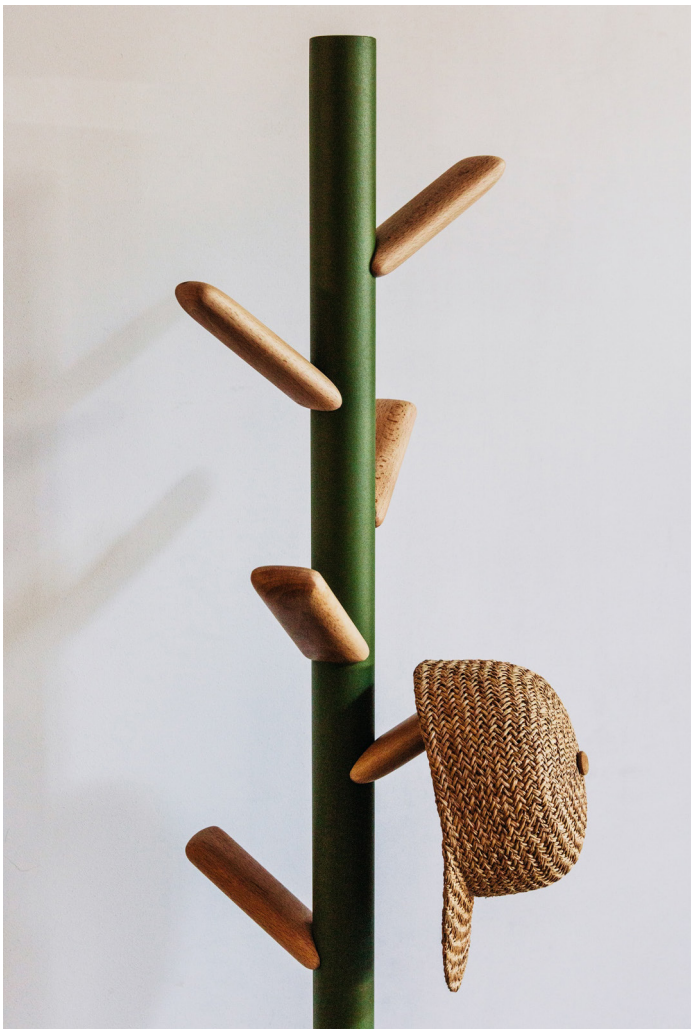
This elegant and minimalist coat rack allows you to play with different tones, textures and materials.