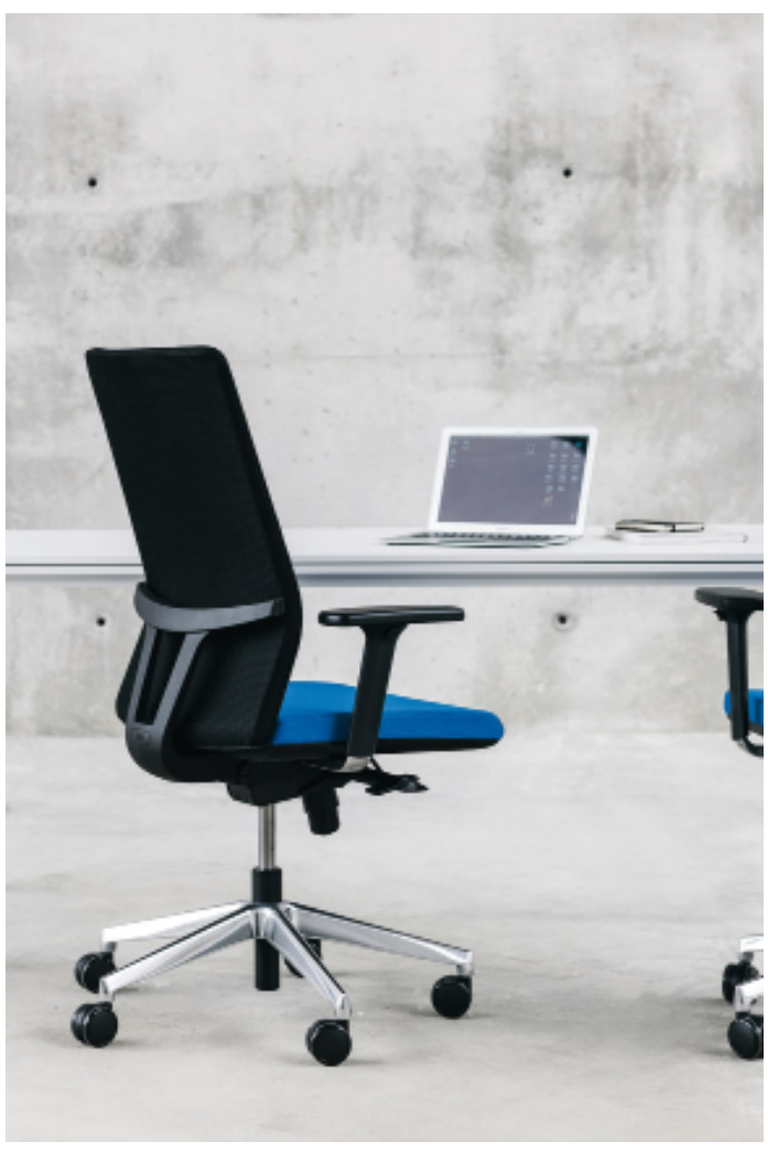
Features include lumbar adjustment, variable seat depth and height, adjustable armrests, and the option to recline both the seat and the backrest.